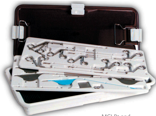
MCLB1 and MCL190